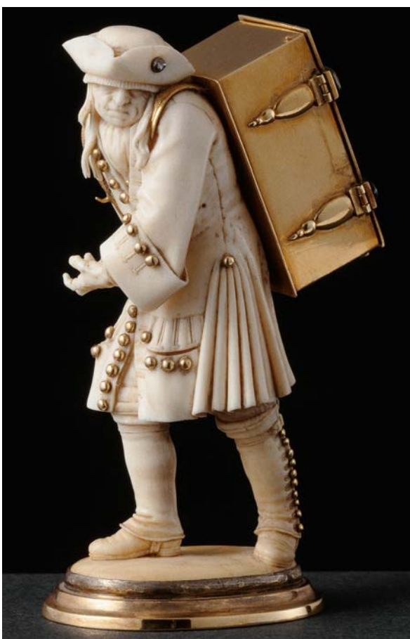
15 - Statuette of a pedlar