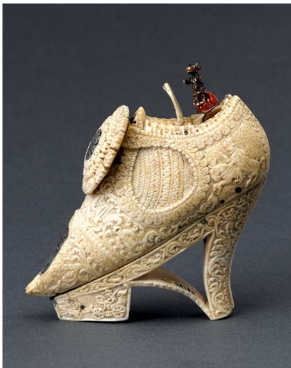
13 - Platform shoe