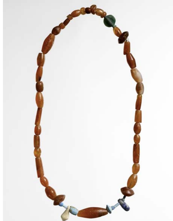
2 - Necklace, carnelian