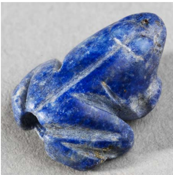
3 - Small lapis-lazuli bead in the shape of a frog