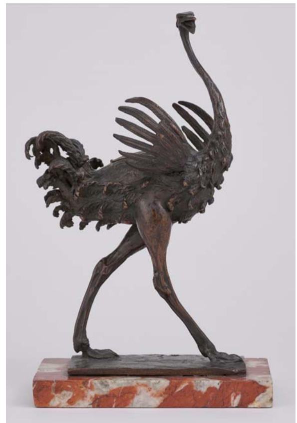
12 - Ostrich