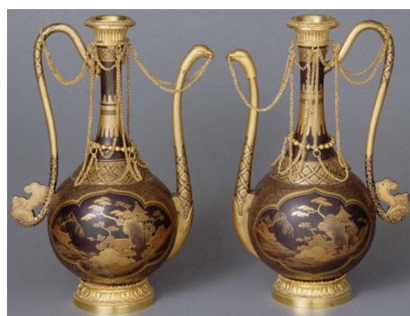
16 - Pair of ewers