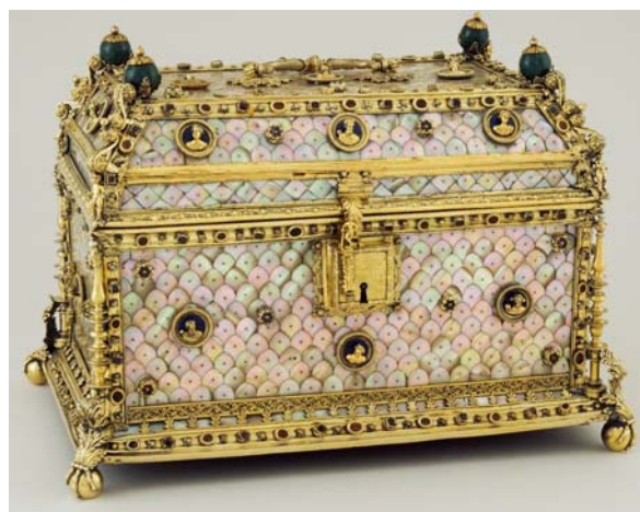
14 - Casket