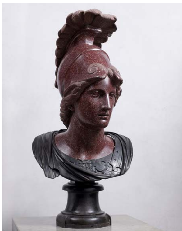
7 - Minerva or Alexander the Great