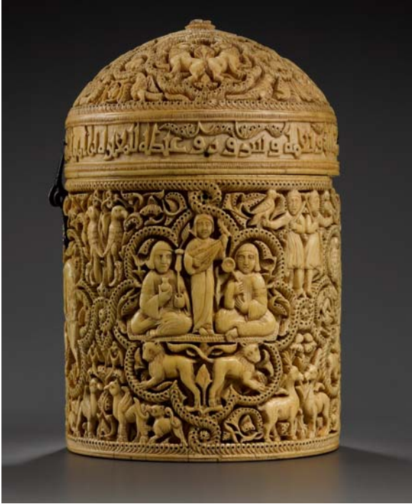
9 - Pyxis bearing the name of al-Mughira