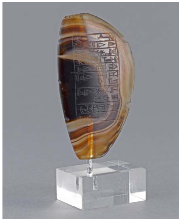
6 - Bead offered to the moon-god, by the divine king of Ur, Ibbi-Sin, for his life