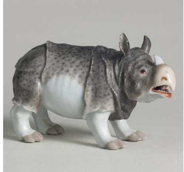
10 - Clara the Rhinoceros