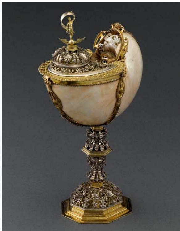
5 - Nautilus with metalwork mounting