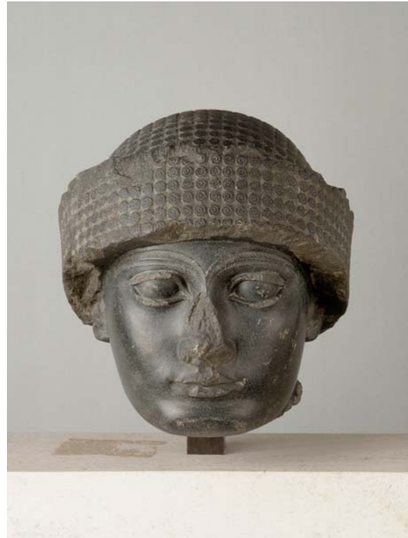
Gudea, Prince of Lagash

Not only stones, shells, and plants travelled between continents; so did live animals, often for political ends. The populace as well as artists discovered ostriches, giraffes, and elephants, which became objects of fascination. Manmade objects followed the same routes; beyond Europeans' well-known yen for exoticism, this exhibition shows that these multiple round trips wove a more complex history.