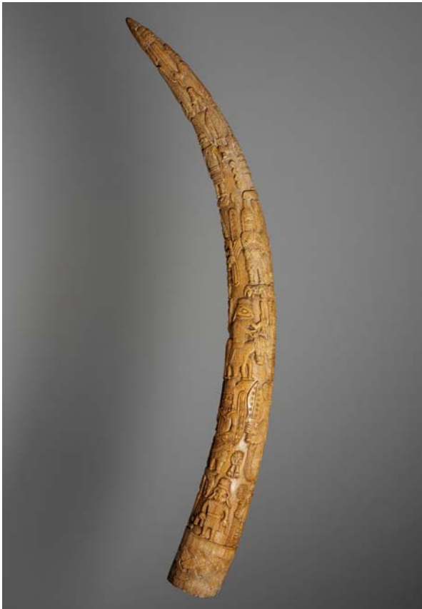
11 - Carved tusk