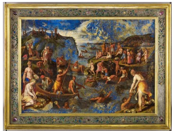
4 - Pearl Fishing in the Indies, oil on lapis lazuli, Tempesta