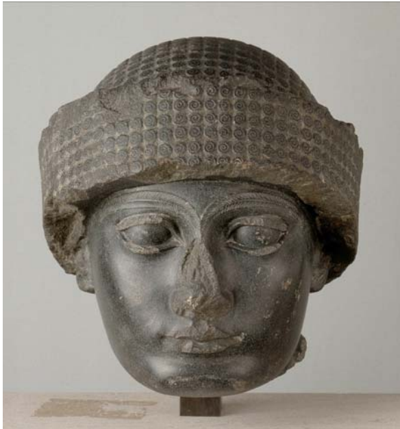
1 - Gudéa, Prince of Lagash

Please include photo credits and send a copy of your article to: Jeanne.scanvic@louvre.fr