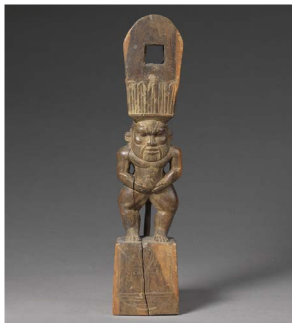
8 - Leg of an article of furniture